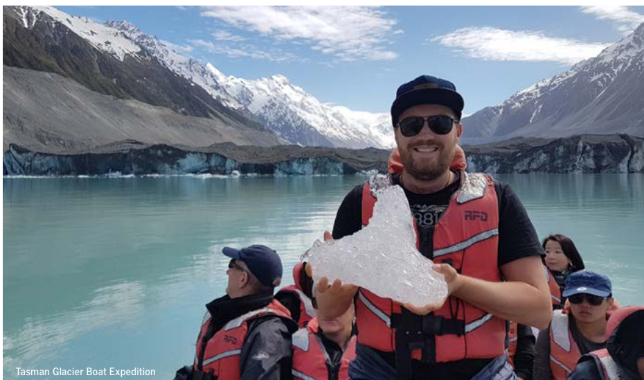
Tasman Glacier Boat Expedition

Today we experience the Tasman Glacier in the most unique way possible. An experienced guide will whisk you away in a stable MAC Boat to explore the melting ice-face of the Tasman Glacier. Get up close to touch and taste 400-year old icebergs that have been carved into the murky waters of the lake. This afternoon, there is time to enjoy one of the many bush walks. Optional ski-plane and helicopter flights are available (subject to weather conditions).