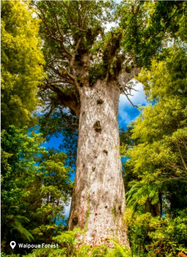
📍 Waipoua Forest