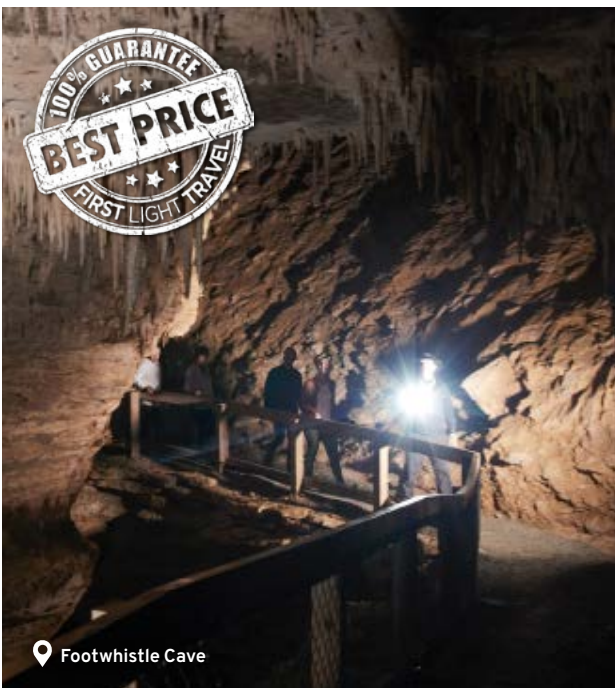
📍 Footwhistle Cave

11 DAYS Wellington • Hawke's Bay • Taupo • Huka Falls • Rotorua • Auckland • Waipoua Forest • Bay of Islands