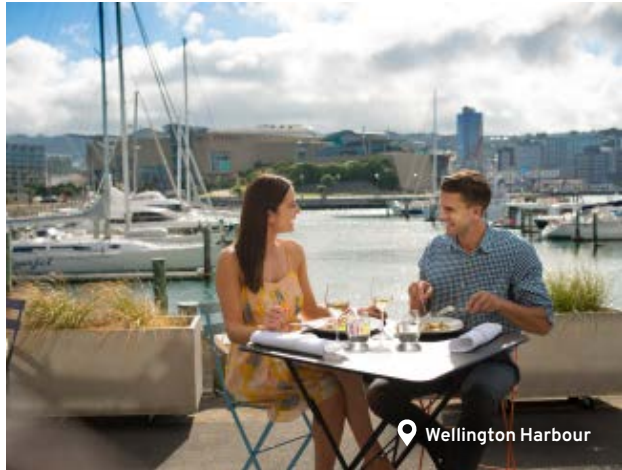
📍 Wellington Harbour