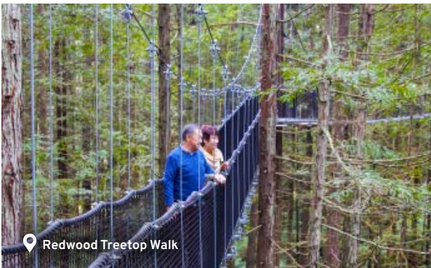
📍 Redwood Treetop Walk