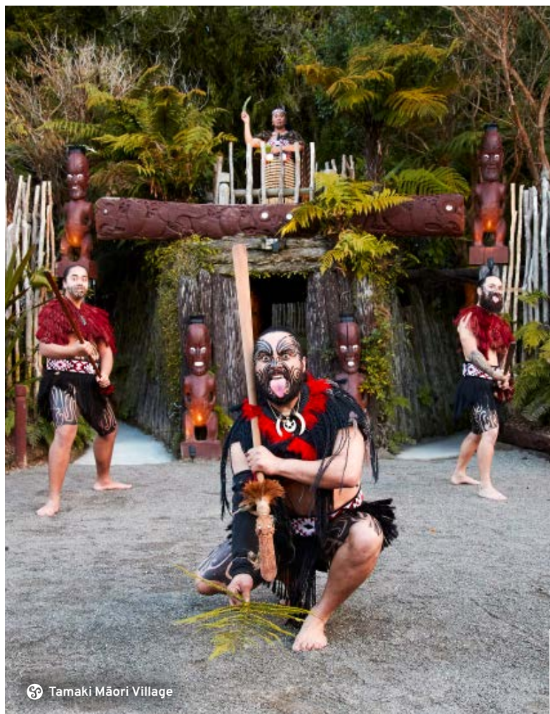
📍 Tamaki Māori Village