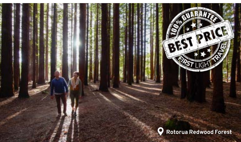
📍 Rotorua Redwood Forest