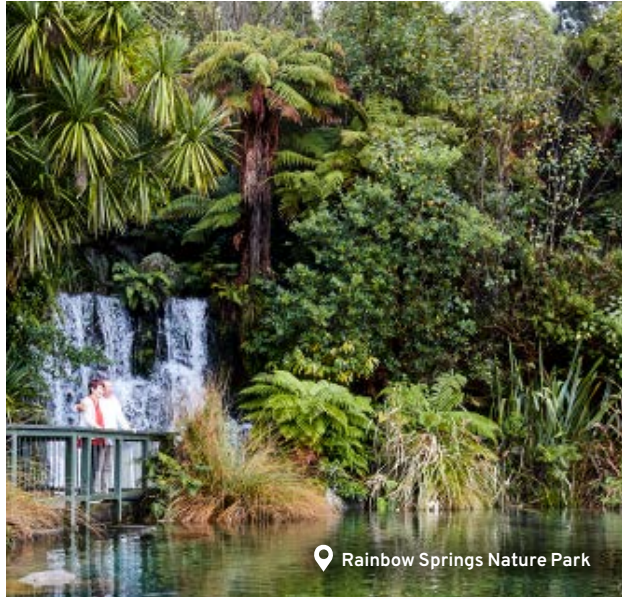
📍 Rainbow Springs Nature Park