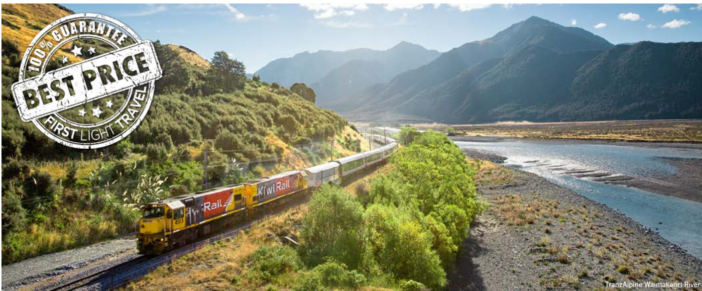
TranzAlpine Waimakariri River