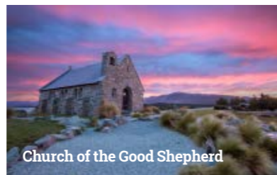
Church of the Good Shepherd