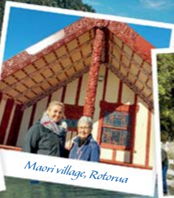
Maori village, Rotorua