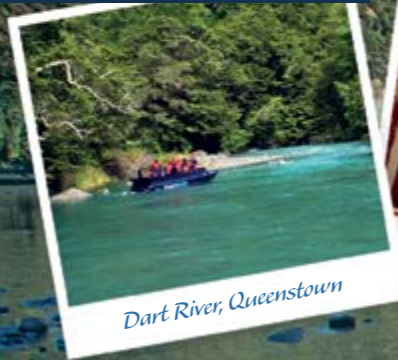
Dart River, Queenstown