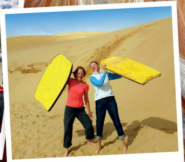
Fun in the sun