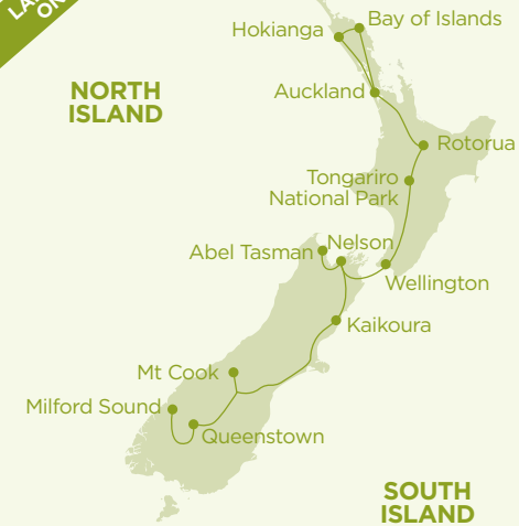
Kakariki Tour Map