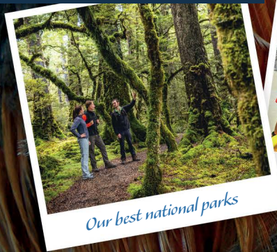
Our best national parks