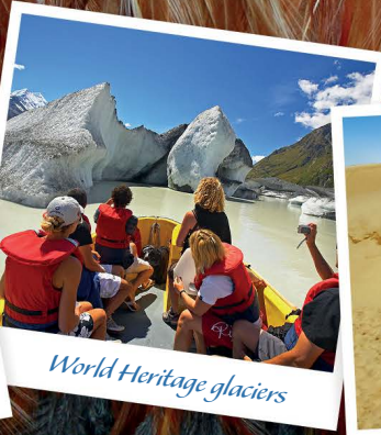
World Heritage glaciers