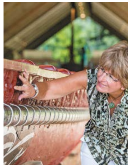
TOP TO BOTTOM: Tane Mahuta, the Lord of the Forest; board the TranzAlpine scenic rail journey; explore the Waitangi Treaty Grounds.