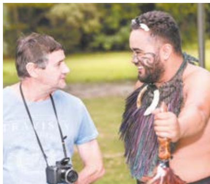
TOP TO BOTTOM: Board the vintage steamship TSS Earnslaw and cruise across Lake Wakatipu to Walter Peak Station; visit Lamach Castle where you hear of the tragic and scandalous history on a guided tour; feel the spirit as you are immersed in Maori culture; explore the Waitangi Treaty Grounds.