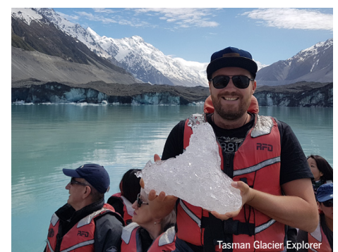
Tasman Glacier Explorer