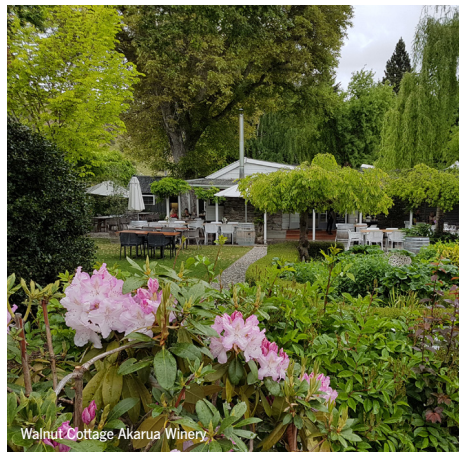
Walnut Cottage Akarua Winery

Optional overnight cruises on Milford Sound or Doubtful Sound are also available subject to availability - ask us for details.