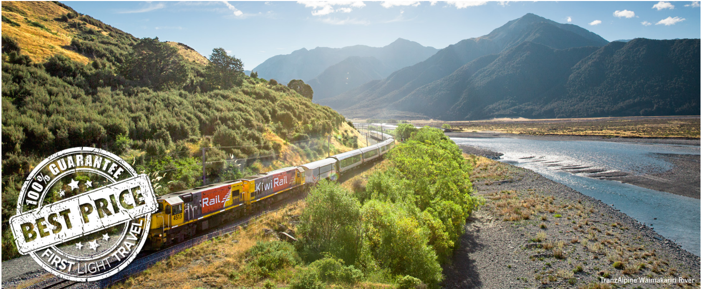
TranzAlpine Waimakariri River