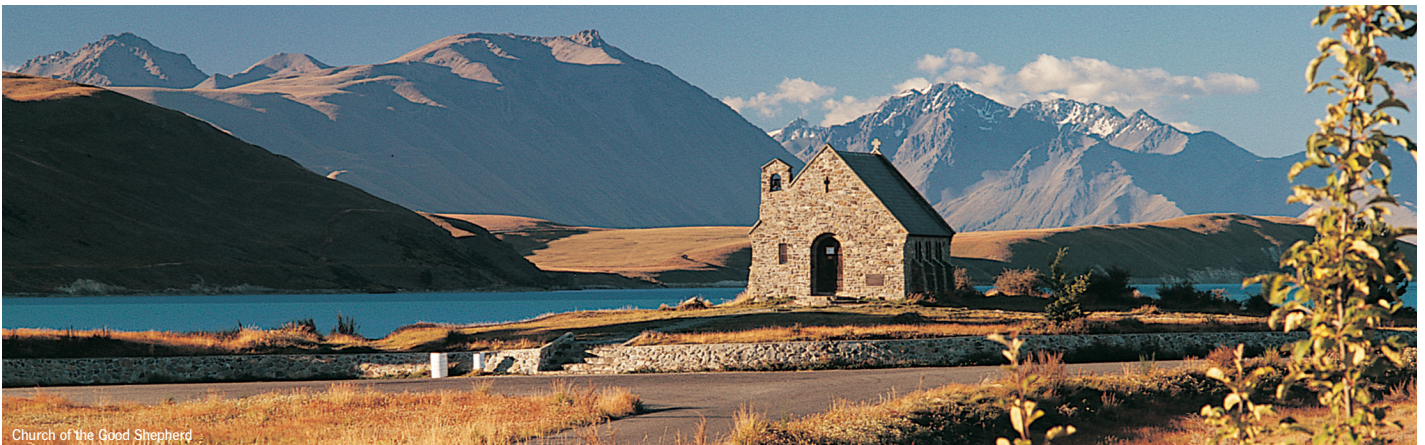
Church of the Good Shepherd

Stay: Distinction Dunedin Hotel (2 nights)