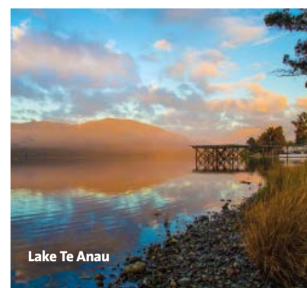
Lake Te Anau

Your holiday concludes this morning after breakfast. You'll be transferred to Christchurch Airport for your onward flight. B