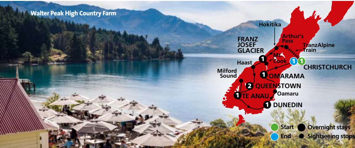
Walter Peak High Country Farm