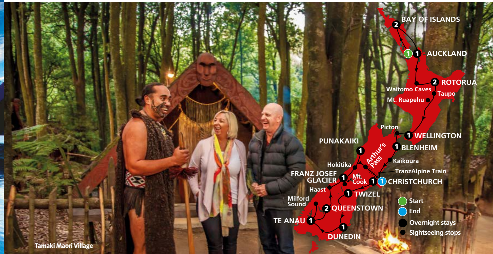
Tamaki Maori Village