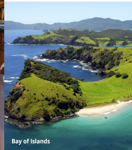
Bay of Islands

Please check our website for up to date pricing and specials