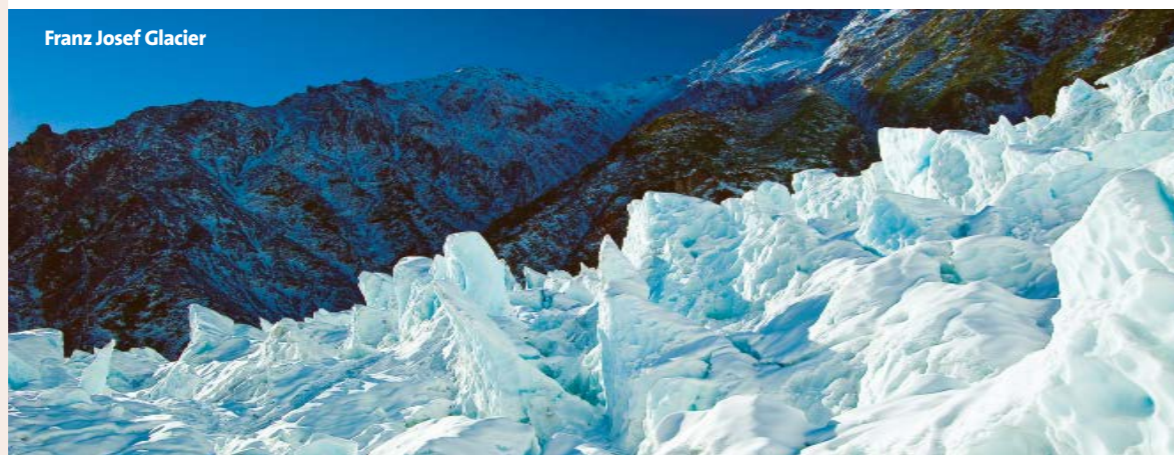
Franz Josef Glacier