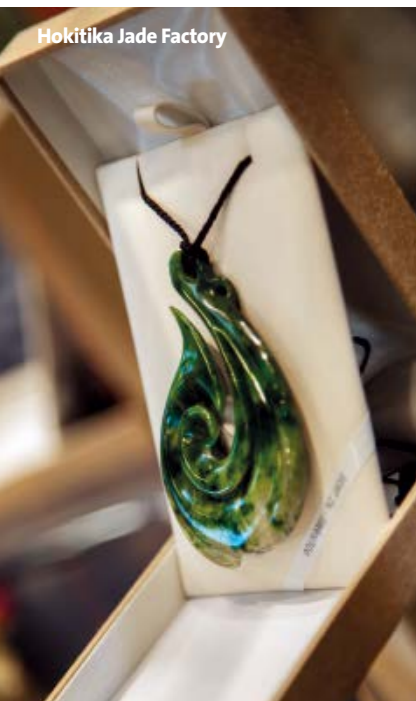
Hokitika Jade Factory