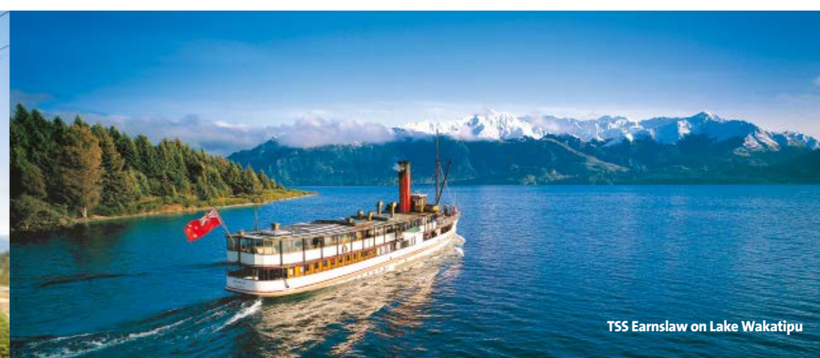
TSS Earnslaw on Lake Wakatipu