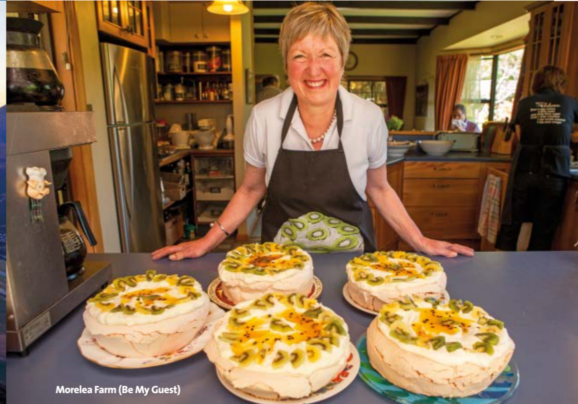
Morelea Farm (Be My Guest)