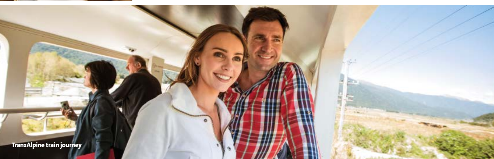
TranzAlpine train journey

Journey north from the Bay of Islands, exploring the natural wonders of the very top of New Zealand on a full day tour. You will see the grandeur of the mighty Kauri trees, the expanse of Ninety Mile Beach and the mystique of Cape Reinga. Ask your Travel Director for details.