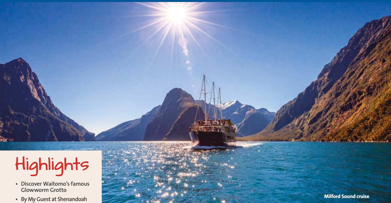
Milford Sound cruise

FIRSTLIGHTTRAVEL Your South Pacific Travel Specialists