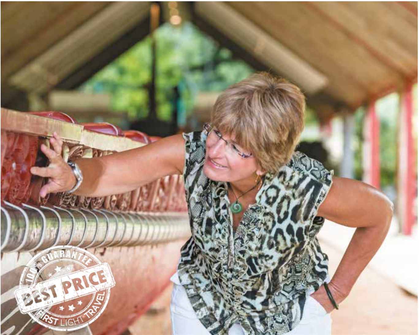
Waitangi Treaty Grounds, New Zealand's most important historic site.